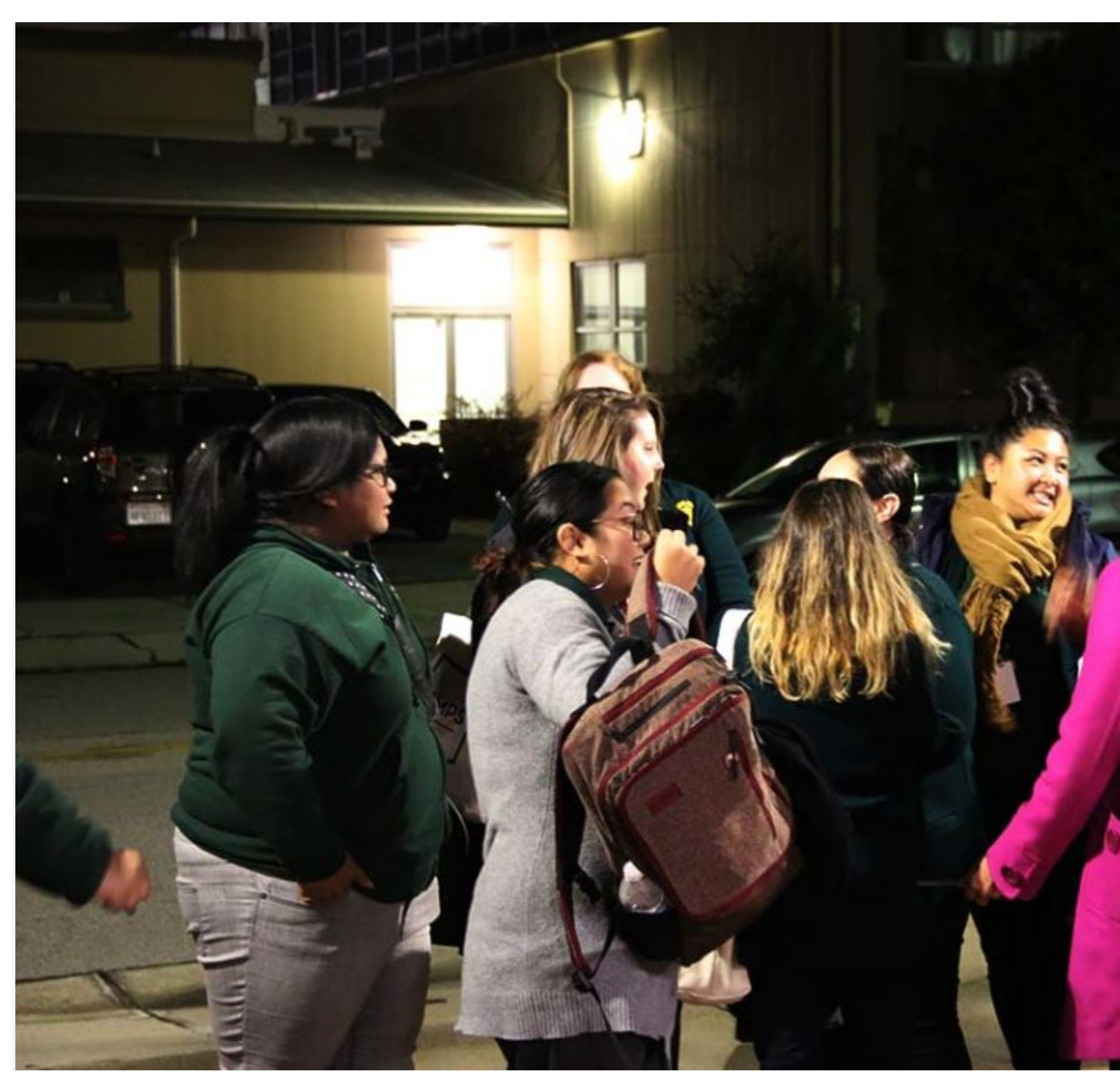
Charter renewed amid school board shift